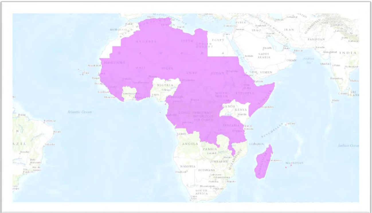
Extent of OSM Content in Esri's Basemaps in Purple Shading