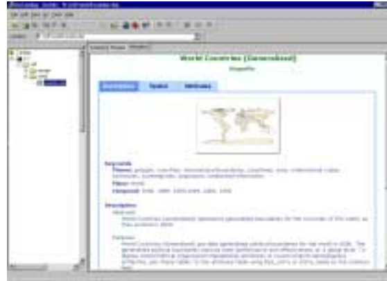
The metadata preview includes descriptions about the data (e.g., source, content, accuracy), spatial coordinates, and information about the individual attributes.